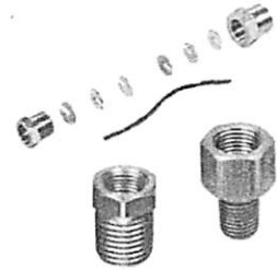
4650-001, 4590-043/044, 4590-173

Add-on stuffing box kits are used when an application requires a stuffing box and the replacement control does not have one built-on. These add-on stuffing box kits are designed to fit all capillaries and will fit all sensing bulbs up to 3/8" in diameter. They are designed to convert a standard (non-stuffing box) control to fit a stuffing box application.