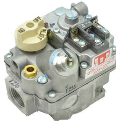
Standard 700 shown with Millivolt gray top actuator

The Robertshaw® 700 Series Gas Valves are the industry standard with capacity ranges from 5,000 to 1,150,000 BTUs. Several actuator types are available depending upon the application such as 24 Volts, Line Voltage, Millivolt and Hydraulic.